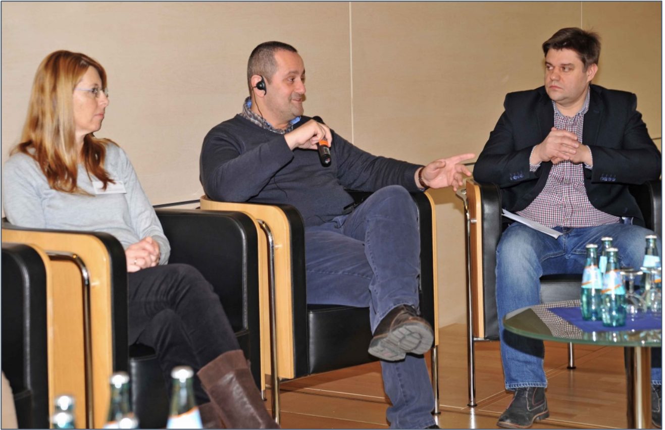
The maltese partner reporting about his network on the island.