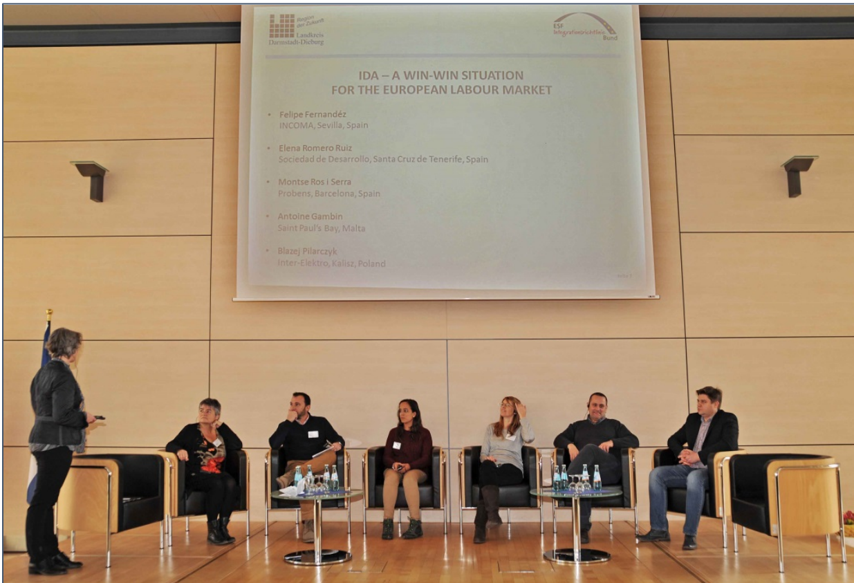
Interviews on panel with European partners in IdA