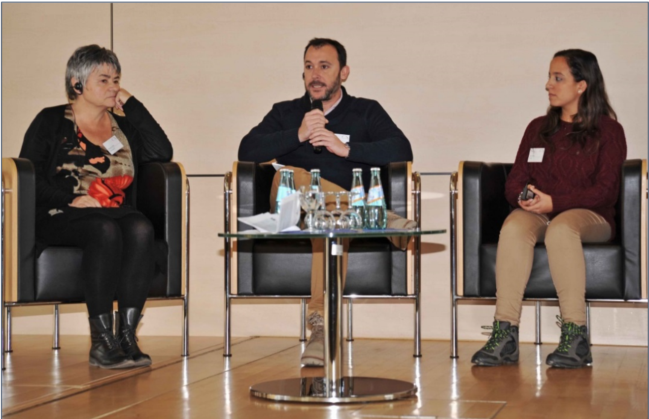
Spanish partners talking about their experiences with IDA.