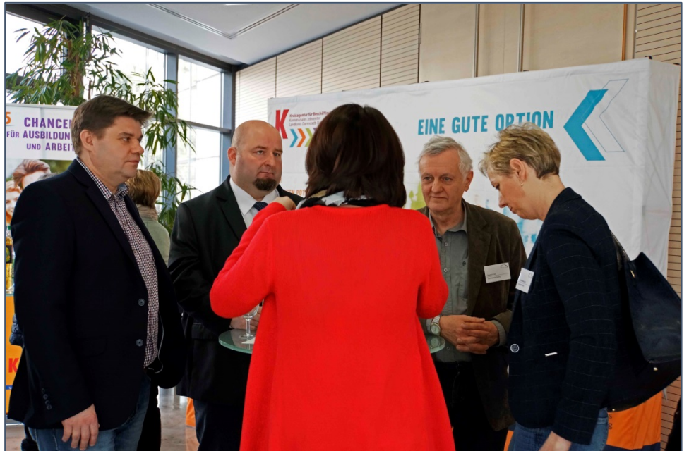
Transnational partner from Poland in a conversation