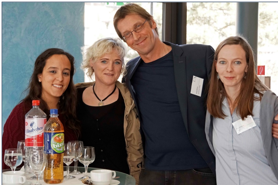
Transnational guests and national experts networking during the coffee break