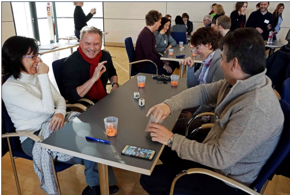
Guests during practice "KultuRallye"